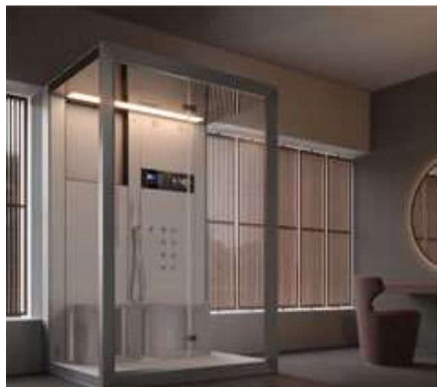
Shower & Steam